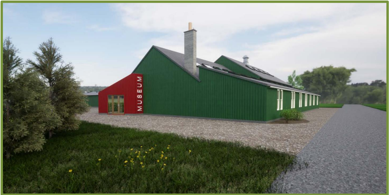
Architects' impression of possible new exterior for the building

In early 2024 we hope also to be in a position to submit our application for a Community Asset Transfer (CAT) of the Museum building to Aberdeenshire Council.