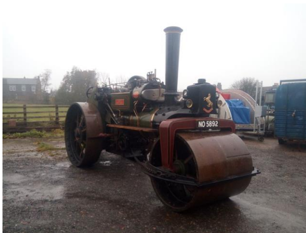
Steam roller at October Steam & Stationary Engine Day