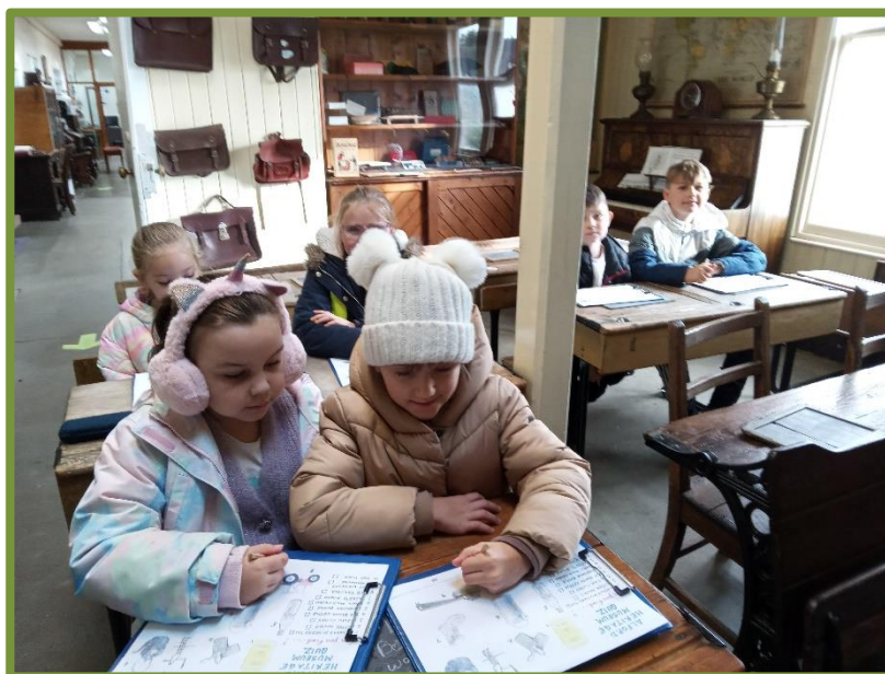
Crathie School (left) study the Victorian post box, while Fernielea After School Club experienced what it was like to go to school in bygone days

Events for enthusiast agricultural model collectors and stationary engine operators also caught the attention of the public, and we plan to hold these events again next year.